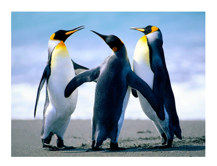
Figure 4: Stego image pc1.jpg - 1024 \times 768