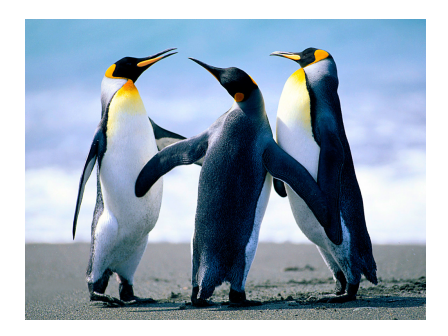
Figure 3: actual image pc1.jpg - 1024 \times 768