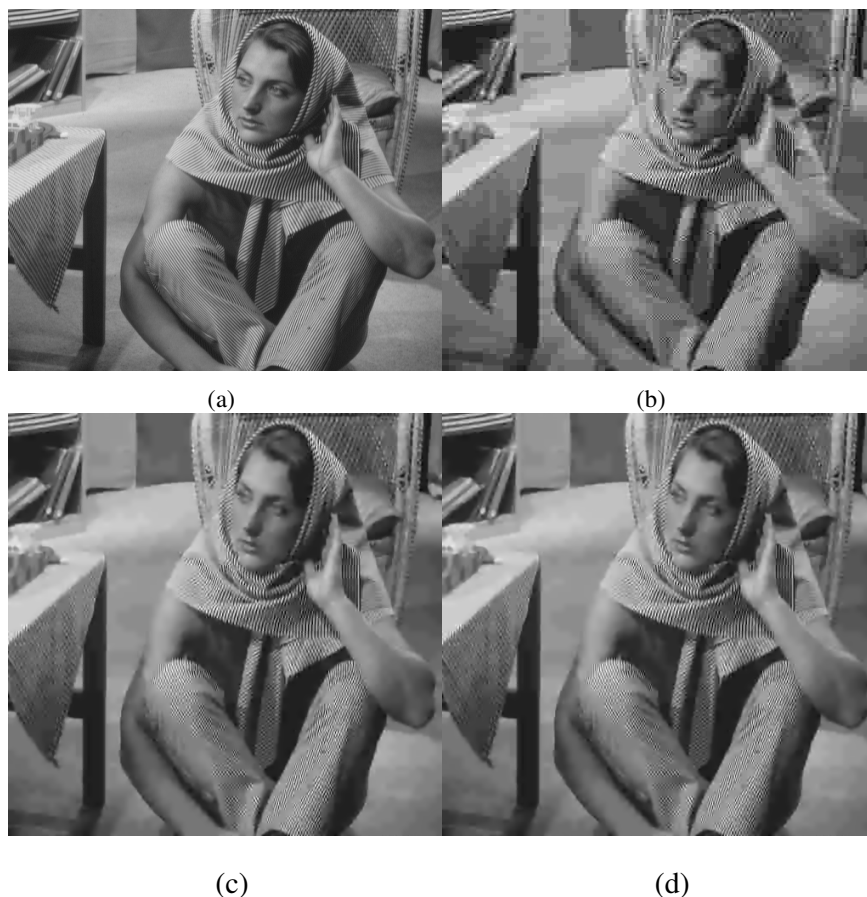
Figure 2. Deblocking results for Barbara image (a) Original (b) Block DCT compressed with Q2 (PSNR=25.59 dB) (c) Processed with Liew and Yan's [12] algorithm (PSNR=26.04 dB) (d) Processed with proposed method (PSNR=26.14 dB)