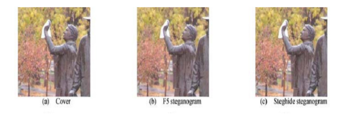
Figure 1. Cover Image, F5 Steganogram and Steghide Steganogram in (a), (b) and (c).

The change in joint density due to message embedding is shown by the following example. Figure 1 shows the cover image, F5 embedded image and the steghide embedded image. Figure 2 shows the compressed DCT neighboring joint density probability, the neighboring joint density distribution of a F5 steganogram carrying some hidden data and the neighboring joint density distribution of a steghide steganogram carrying some hidden data. From figure 2 it is clear that the neighboring joint density is approximately symmetric about the origin. Figure 3 shows the difference of neighboring joint density of F5 steganogram and steghide steganogram with cover image. So by embedding message the neighboring joint density get modified.