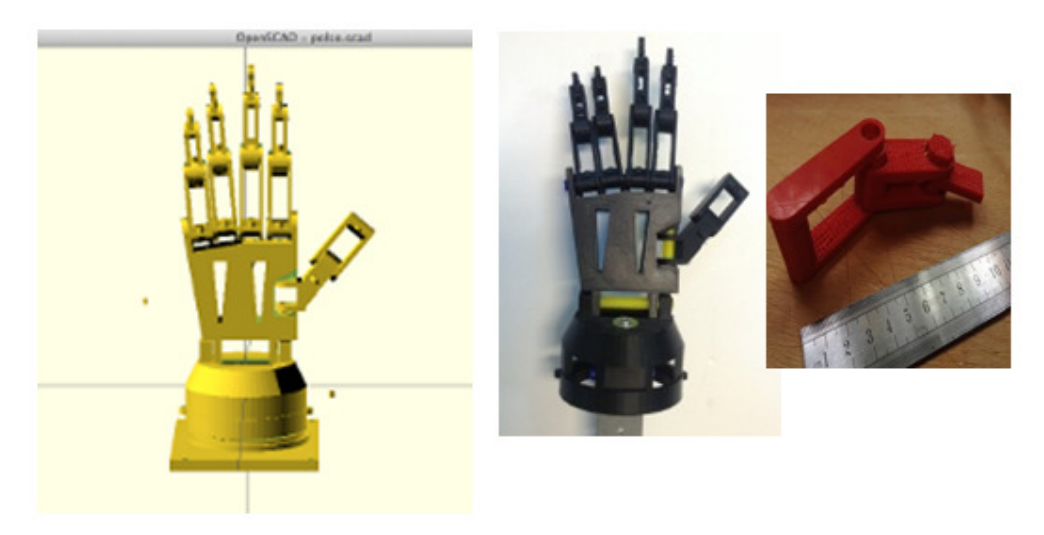
Figure 1: Modellng process: OpenSCAD design and 3D printout. Example of modular finger is on the right.

Our Voice to SL Translator consists of a robotic hand aiming to satisfy an important fundamental human need such as face to face communication. As shown in Fig. 1, the robotic hand has been designed using the OpenSCAD software [5] and is made out of PLA bioplastic by means of a low-cost 3D printer [6]. This 3D hand is printed with the FDM technology and the fingers are printed in one shot as single objects, without the need of any screws to ensemble its parts.