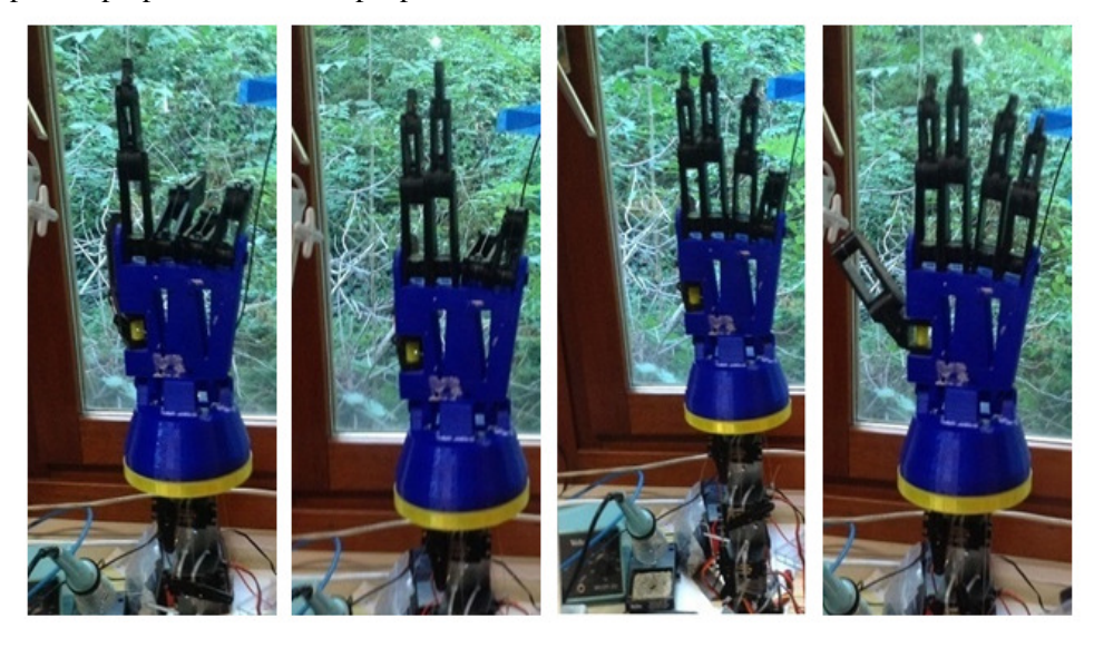
Figure 3: SL sequence for numbers 1,2,3 and 5 following the voice of an interlocutor (see video in [10]). Robotic devices in general can also be useful for teaching purposes. By constructing a prototype,

Our open device is different from alternative approaches designed for those people with hearing problems. In fact, among the available applications, there are those which can translate voice into text like Telecommunications Device for the Deaf (TDD). Alternative smarthphone Apps include, e.g., the finger App, which can play SL and can recreate gestures of one hand by typed text. Important to notice is that smartphones Apps can make massive use of the battery for long talks. A non-hearing person may also communicate by cell phones via SMS texting. There are also special systems, called Auditory Science Interact (AS), that transmit written text in streaming to the interlocutor (for a recent review see, e.g. , [12]). However, so far as we know, there does not exist an application that can translate the voice directly into SL as done with our first prototype. Vocally controlled robot arms, e.g. the earlier VoiceBot, have been proposed to follow voice commands limited in their movements and actions, such as opening and closing fingers, holding objects or moving them from an initial position to a target [11,13-17]. Such robots do not have any specific purpose for the deaf people.