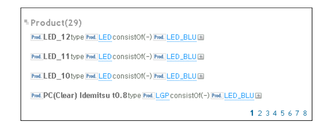
Figure 5. Search result of LED_BLU in product domain

Now, let's get into more detailed discussion on the main panel to present the retrieved results. Figure 5 shows only search results for the 'Product' category in case of LED_BLU keyword.