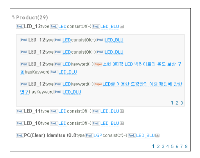
Figure 7. Various result in a group

Our semantic search system provides advanced search method, AND operator, in addition to the basic search function. If a user wants to find concepts that are related to two keywords, she or he can use AND operator with the two keywords. If user searches including two keywords in traditional keyword search site, it shows contents which include both keywords. However, the results are not what user wants. In our semantic search, we find the concepts that are connected to the both seeds of keywords through properties even though they might not include any keywords.